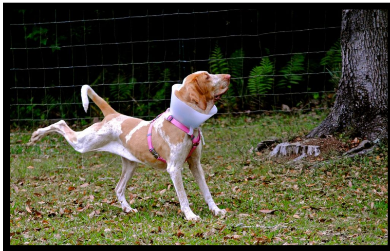
Delaney - who lived for 16 months after diagnosis with amyloidosis.

Any experiences that are anecdotal are noted as such and should be taken with a grain of salt as they are not supported by scientific research.